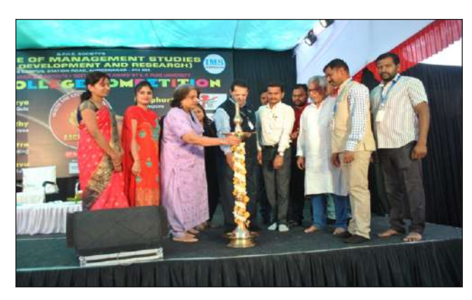
Inauguration Ceremony of 'AAGNEYUM - 2020'