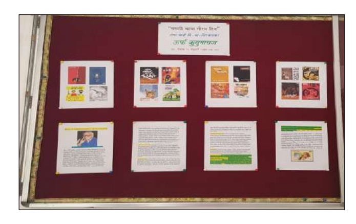
Marathi Bhasha Gaurav Din Display