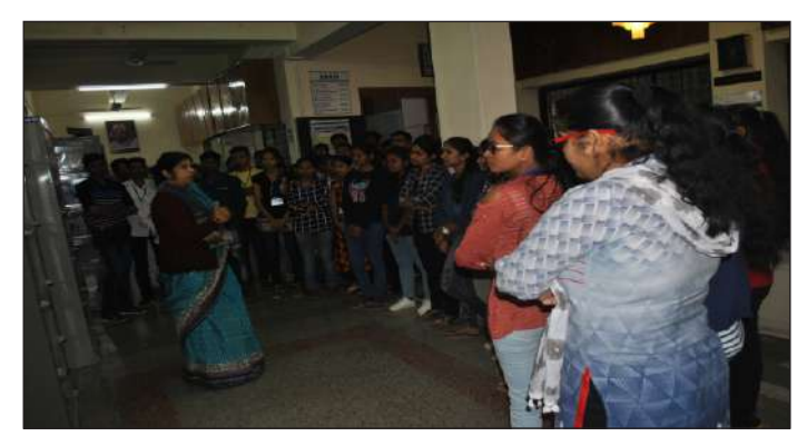
Student participants of Fest-Der-Tech 2020

The participating students from different educational Institute's during the FEST DER TECH conducted by IT Dept. visited the Library on 29th Jan 2020. The Library Staff welcomed students and gave library tour cum orientation.