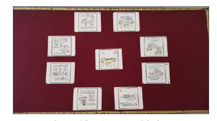
Corona Virus Awareness Display

The library put up informative poster display of COVID -19outbreak's causes, preventivemeasures taken to keep the virus at bay and direction of use of sanitizers to keep safe from the scourge. The hand sanitizers were distributed to academic and administrative departments of the institutes.